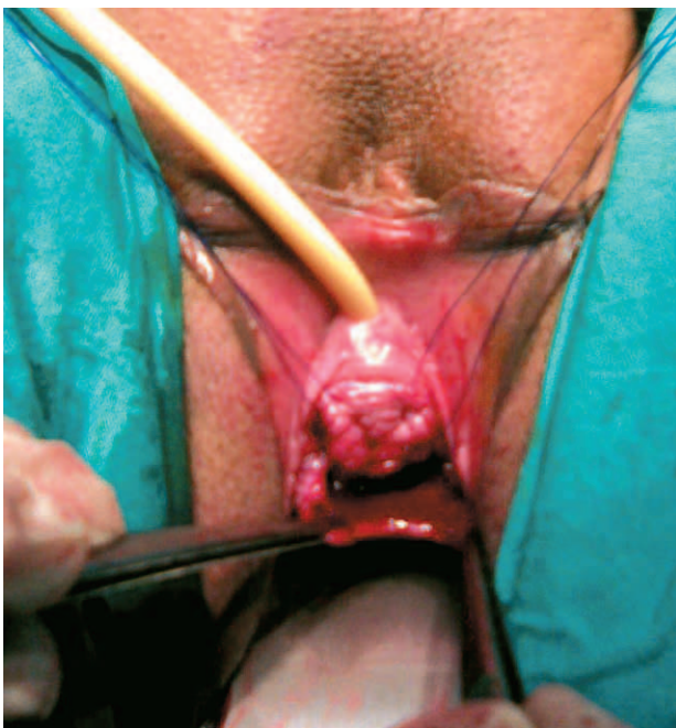
Figure 3. Two suspension sutures are placed at the lateral sides of the sling.

All of the patients were hospitalized for 1 to 2 days. The Foley catheter was left for 5 postoperative days. A vaginal sponge was placed at the end of the operation and removed 24 hours later. The operative time varied from 45 to 90 minutes (mean, 60 minutes). During the postoperative period, sexual intercourse and carrying heavy weights was discouraged for 2 months. All of the patients were followed at 1, 3, 6 postoperative months, and every 4 months thereafter. The mean follow-up period was 22.5 months (range, 17 to 28 months). Postvoid residual urine of 50 mL or less was considered as insignificant. Follow-up evaluation included self-made questionnaire assessment, physical examination with stress test, and postvoid residual measurement. Cure of SUI after the procedure was defined as the absence of any complaint