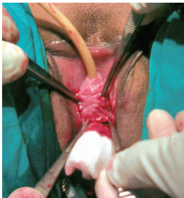
Figure 2. In situ vaginal sling prepared from the anterior vaginal wall after dissection of the vaginal flap was carried out.

and dissection of the vaginal flap was carried out to prepare in situ anterior vaginal wall sling (Figure 2). The length of midline incision at the anterior vaginal wall was determined according to the degree of cystocele. Then, the dissection at the lateral side of the in situ sling was done until the surgeon's index finger could be easily felt from the suprapubic area. A small transverse incision of 4 cm to 5 cm was made over the symphysis pubis without cutting the rectus fascia, and 2 suspension sutures of 1 polypropylene were inserted in